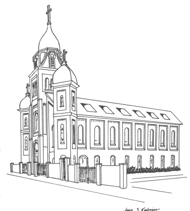
Saint Mary of the Immaculate Conception